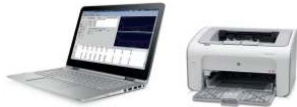
CEA Quality Manager - 1.5.2 (build 1792)